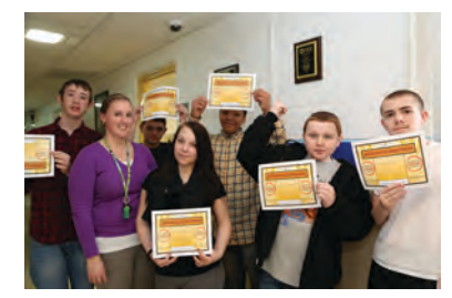
Service learning and community volunteering