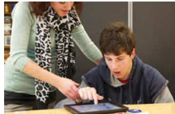
Technology including iPads® & smart boards