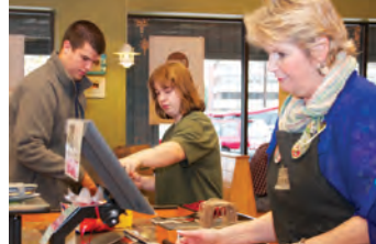
Transition preparation, life skills, & community job-sampling