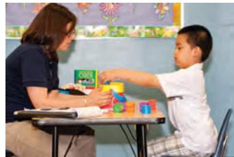
ABA-based instructional methods

Y.A.L.E. School Mullica Township campus Elwood NJ Students ages 3-14