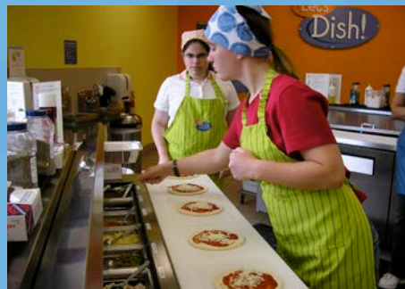
Community-based and campus-based job shadowing, job sampling, internships, and apprenticeships