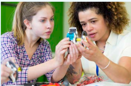
Interest-based clubs and activities including robotics, fine arts, music, fitness and more