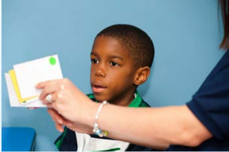
Low student-to-staff ratios