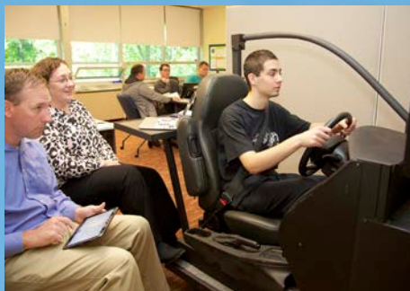
Mobility training with DriveSafety® simulator and software

Standard 9: 21st Century Life and Career Skills (S9) is a tiered high school transition program for students ages 18 to 21 offering five distinct tiers tailored to transition outcomes. All provide preparation for jobs and careers as well as develop social competency, self-advocacy, and adult living responsibilities, such as budgeting and community mobility. Each tier also integrates academic instruction to reinforce skills needed to reach desired post-secondary goals. S9 Employment tier emphasizes work readiness, enabling students to gain experience through Y.E.S. Designs, a school-based business, as well as in community internships and paid jobs on the Cherry Hill campus. S9 Exploration and S9 Scholars tiers, located on nearby community college campuses, support college readiness by targeting the academic, social, and organizational skills needed in higher education. The Vocational Extension tier, based at Camden County College, exposes students to higher level business skills through mentoring and instructional opportunities in a local business district, and entrepreneurial experience managing Bright HorizonS9, a student operated enterprise. Students entering their final year of entitlement, (typically age 20-21), may apply for consideration in Project SEARCH®, a one-year full-immersion internship program located at Kennedy Health System.