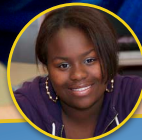
Emotional & Behavioral Support