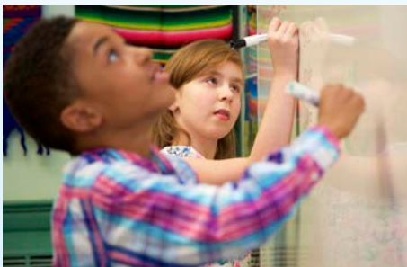
Individualized reading and writing tutoring and support