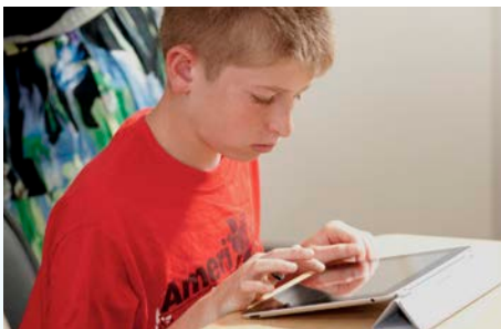
Classroom technology including iPads® & interactive whiteboards