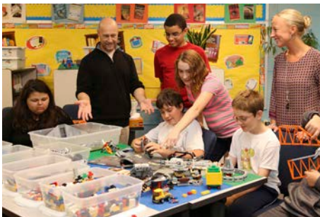
Intensive social skills curriculum combined with academics

Our social learning campuses serve students 5 to 21 years of age who have social learning disabilities such as autism spectrum disorders, ADHD, specific learning disabilities, emotional or social disabilities, and anxiety disorders. These programs provide a full day of instruction with an extended school year program available. Our “school-within-a-school” campuses located within public school buildings allow students the opportunity to interact with typical peers. All campuses offer transition planning and support, community-based instruction, regular workshops and parent trainings, as well as related services.