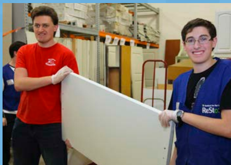
Community projects and service-learning opportunities