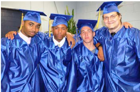
Career prep and transition counseling and support

Y.A.L.E. School Northfield campus, Northfield NJ Students ages 5–21