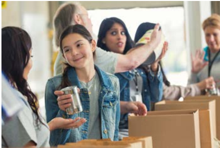
Service learning projects and community volunteering

Students who attend may have a clinical diagnosis such as anxiety disorder, attention deficit/hyperactivity disorder (A.D.H.D.), mood, personality, obsessive-compulsive, or oppositional-defiant disorders, and/or specific learning disability. Most struggle with effective relationships with peers and adults. Students 14 years of age and older receive individualized transition planning and preparation. The program's intensive school-to-work curriculum includes vocational planning and support, job skills training and mentoring, and practical on-the-job experience in the community. Both campus locations also provide short term placement options.