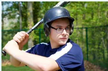
Intramural sports teams

Y.A.L.E. School Medford campus, Medford NJ Students ages 5–14 divided across two Medford public school buildings