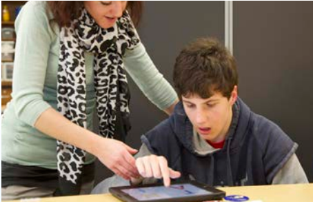
Classroom technology including iPads® & interactive whiteboards