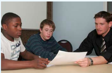
Peer mediation and individual and family counseling