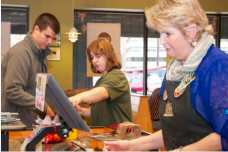
Transition preparation, life skills, & community job-sampling