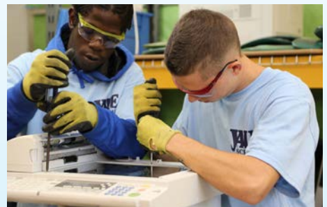
On-campus school-to-work opportunities

“ My 14-year-old started struggling in school in fifth grade. He has had a roller coaster of moods and issues since then. His old school was not understanding or helpful. Then he started Y.A.L.E. in eighth grade and it has been great! The staff is wonderful and go above and beyond to help my son stay in school and be successful. They keep me informed of how he is doing at all times and are very patient and understanding.”