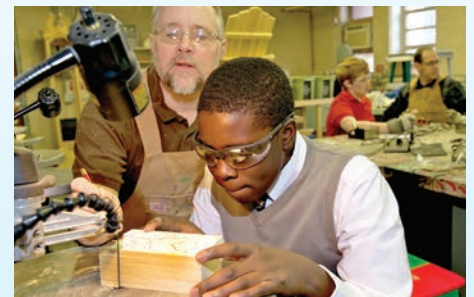
Electives for Cherry Hill students include Industrial Arts, Visual Arts and Media Production