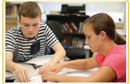
Intensive social skills instruction develops interaction and collaboration