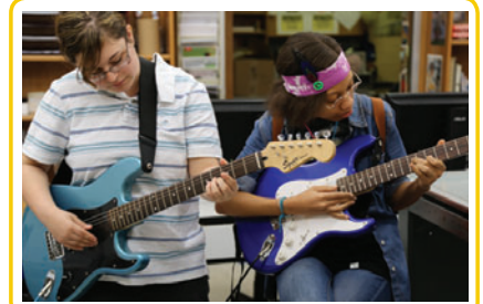
Social Skills clubs and activities including computers, art, music, fitness, intramural sports and more